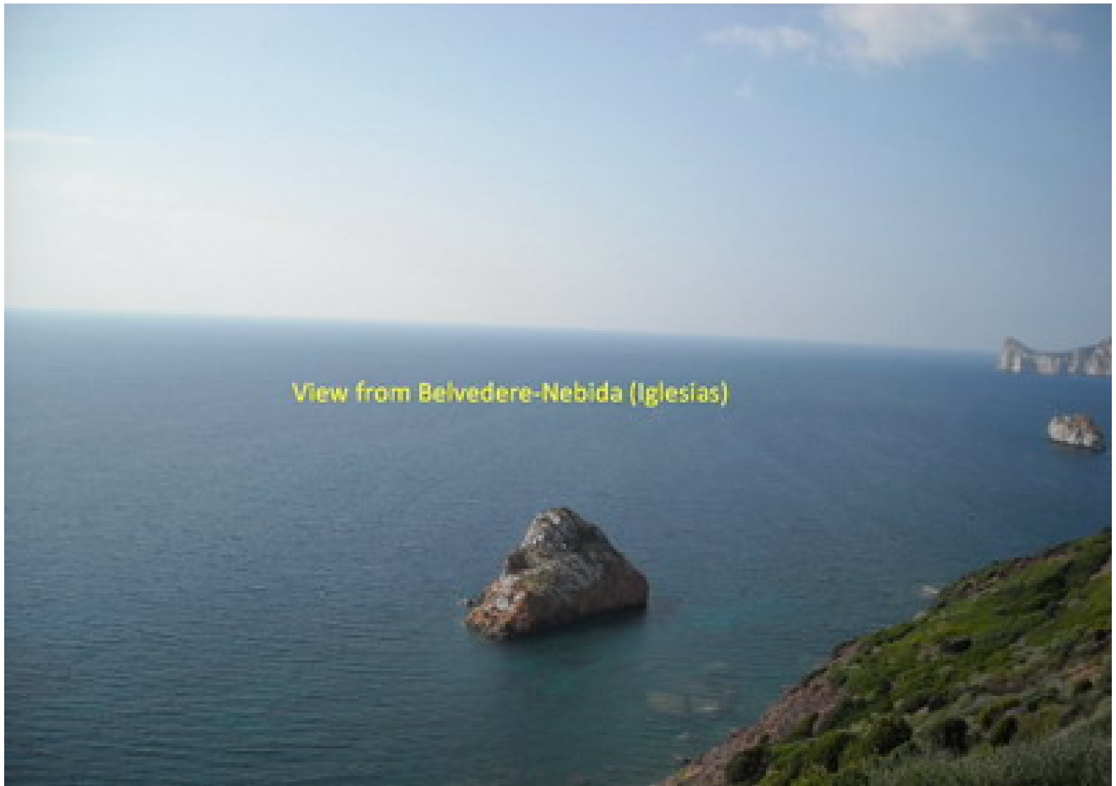
View from Belvedere-Nebida (Iglesias)