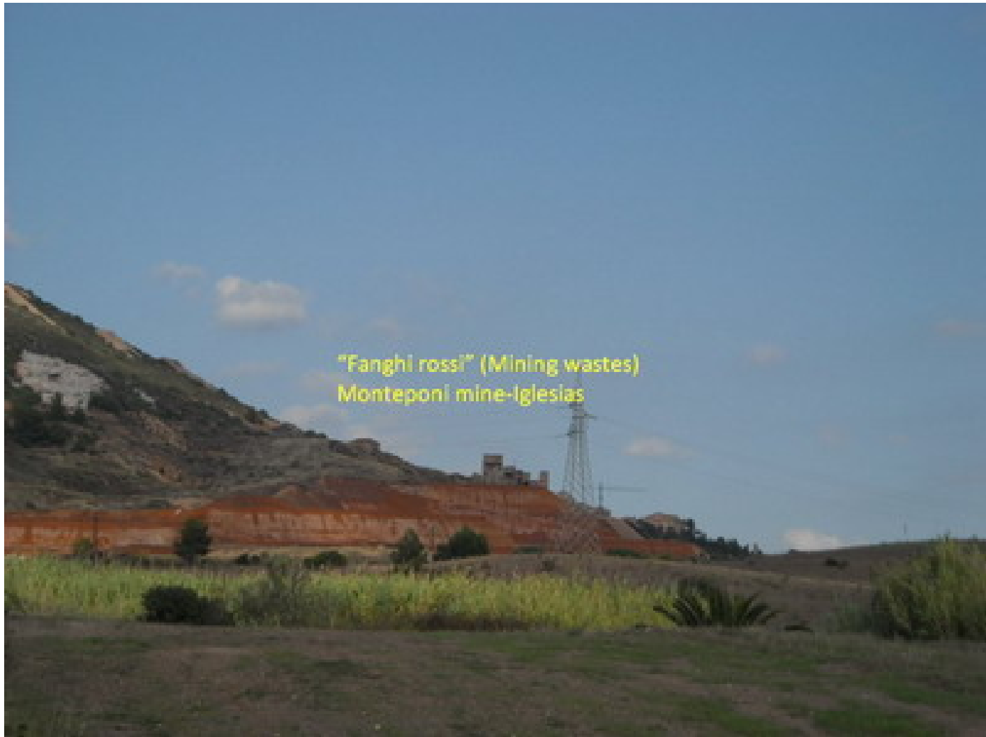
"Fanghi rossi" (Mining wastes) Monteponi mine-Iglesias