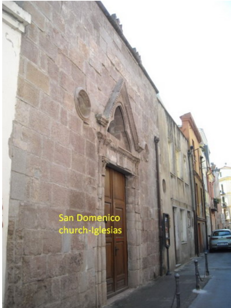
San Domenico church-Iglesias