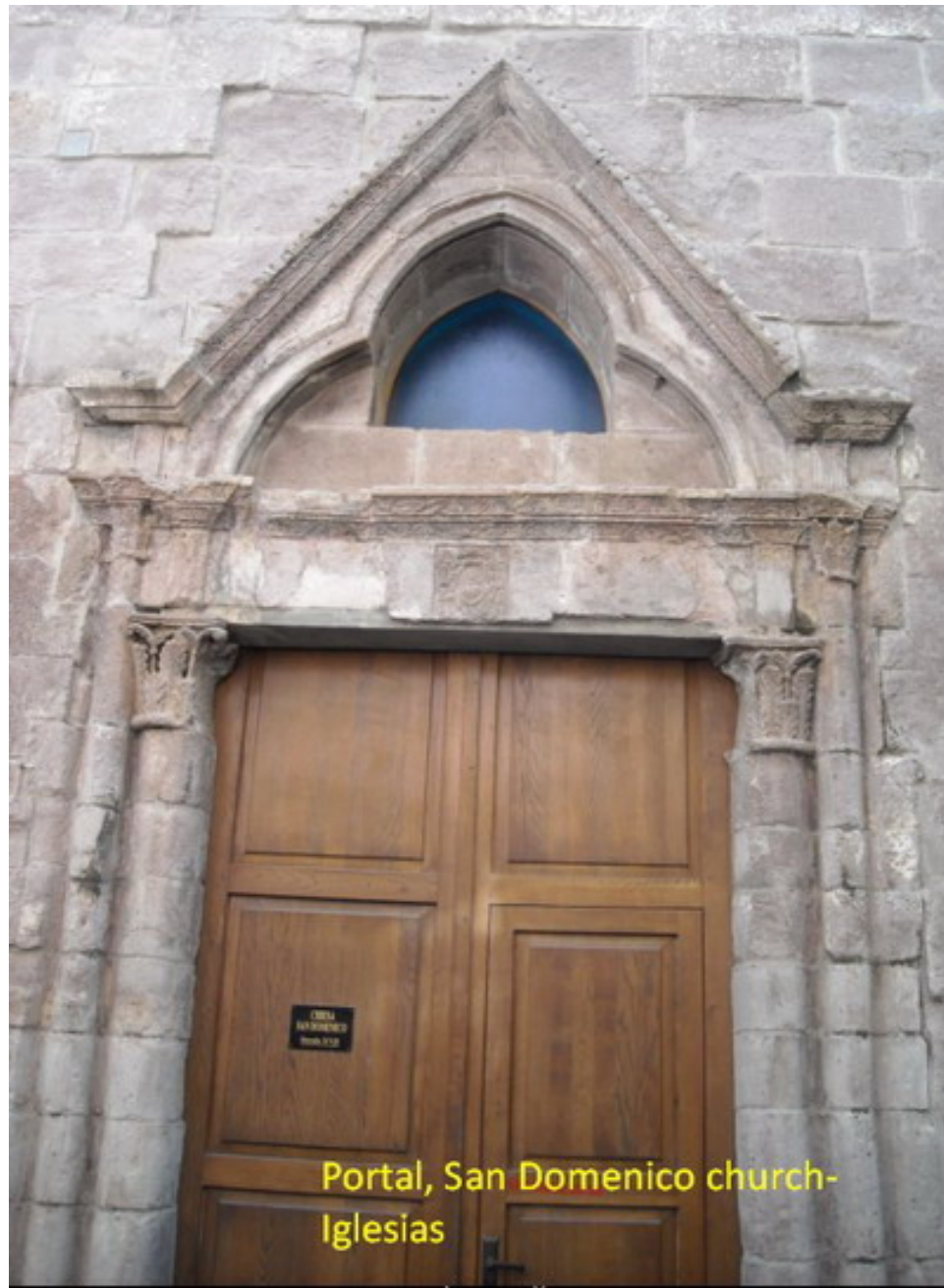
Portal, San Domenico church- Iglesias