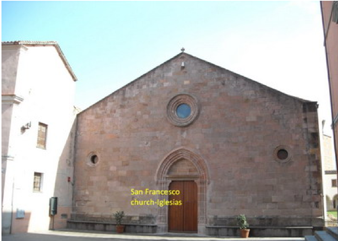
San Francesco church-Iglesias