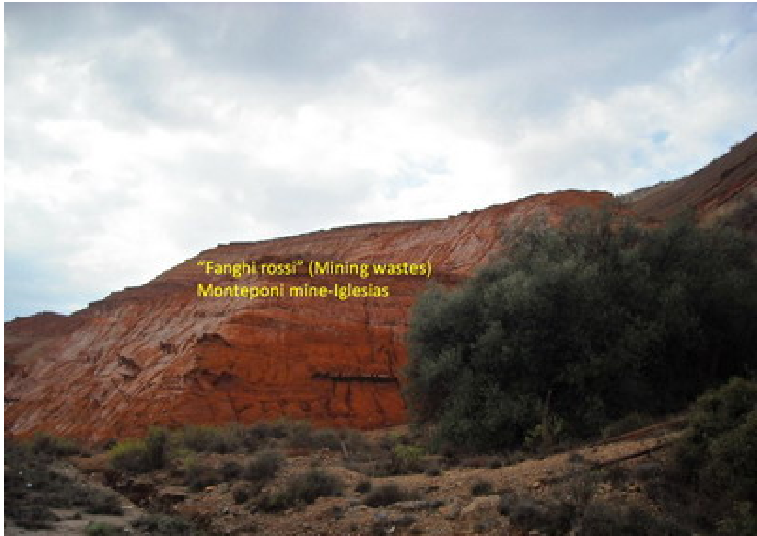
"Fanghi rossi" (Mining wastes) Monteponi mine-Iglesias