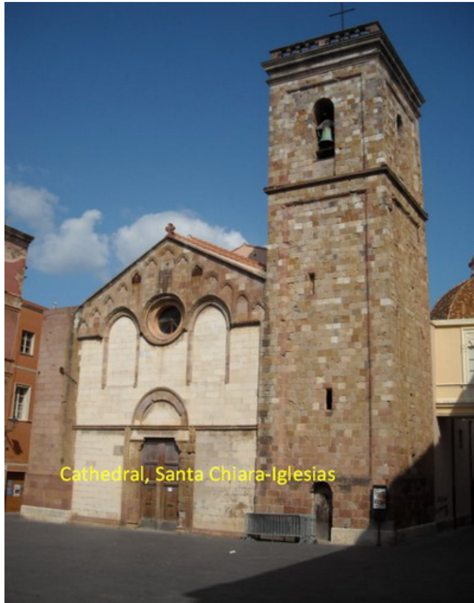
Cathedral, Santa Chiara-Iglesias