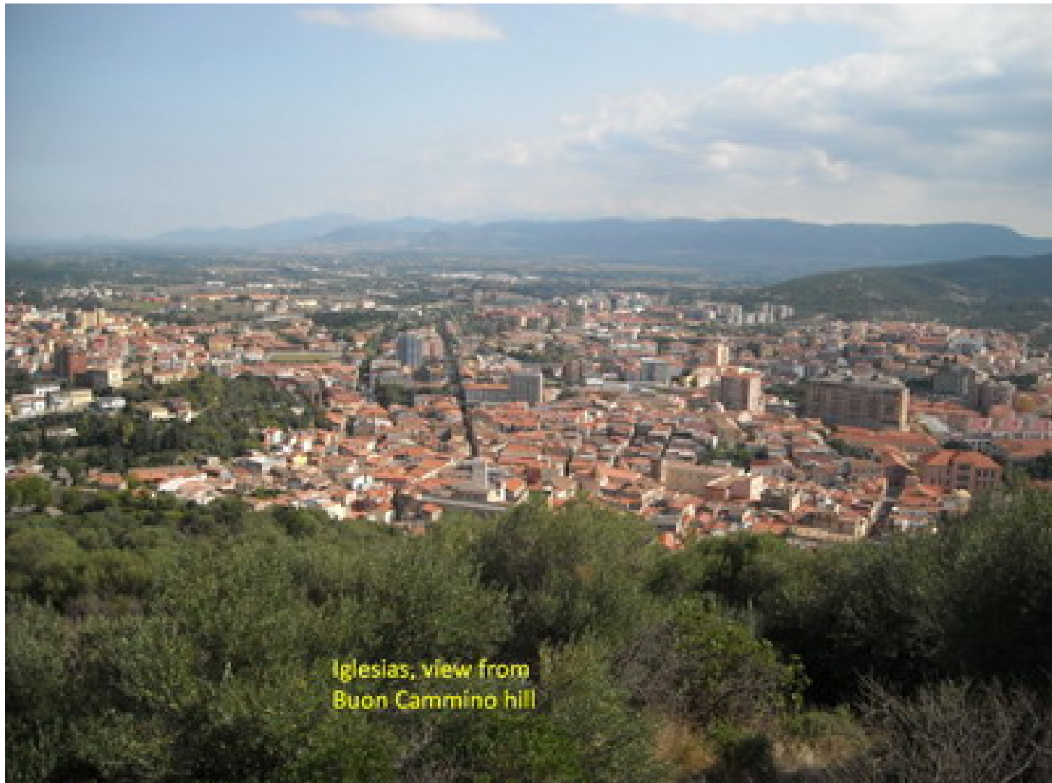
Iglesias, view from Buon Cammino hill