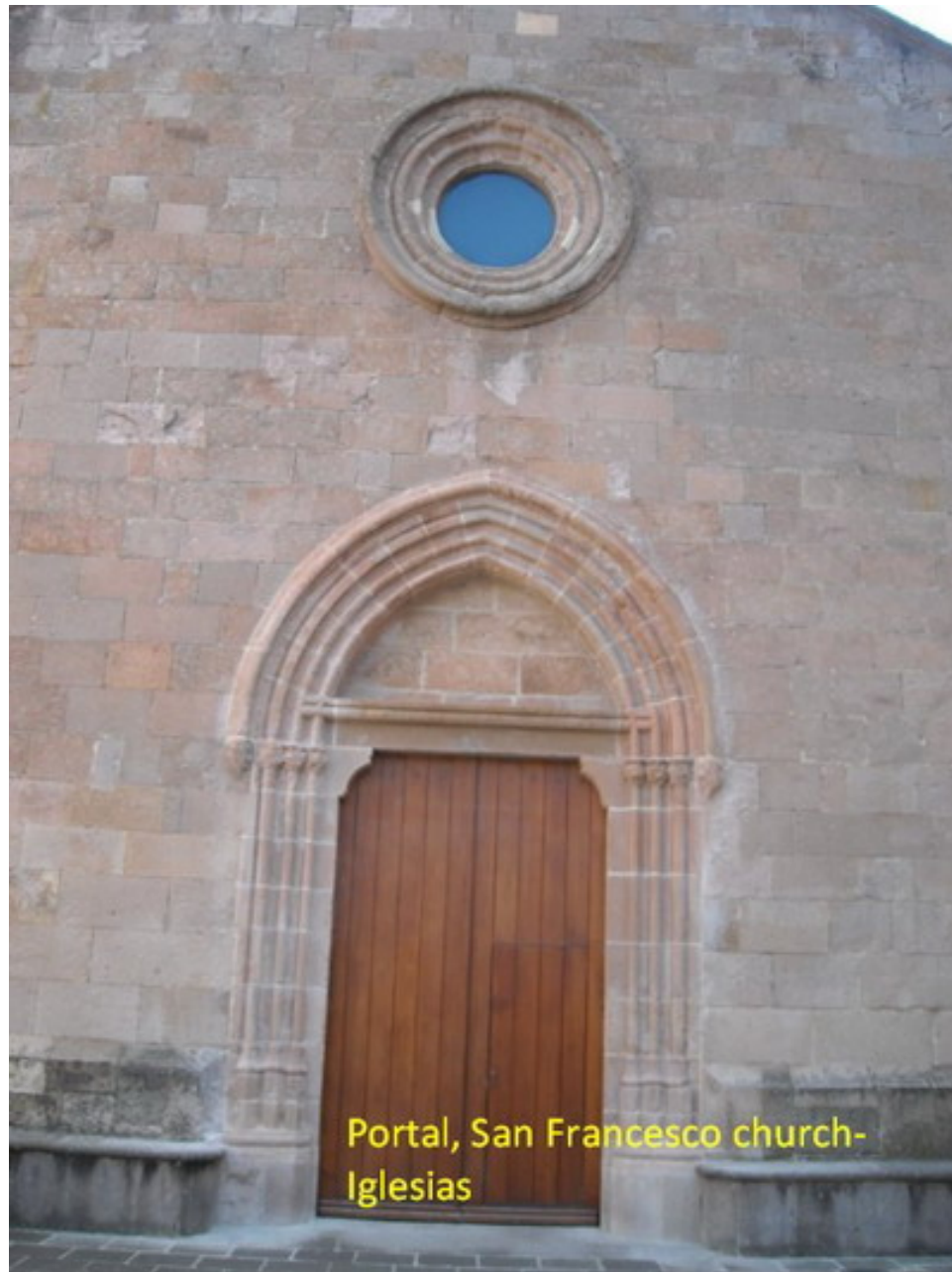
Portal, San Francesco church-Iglesias