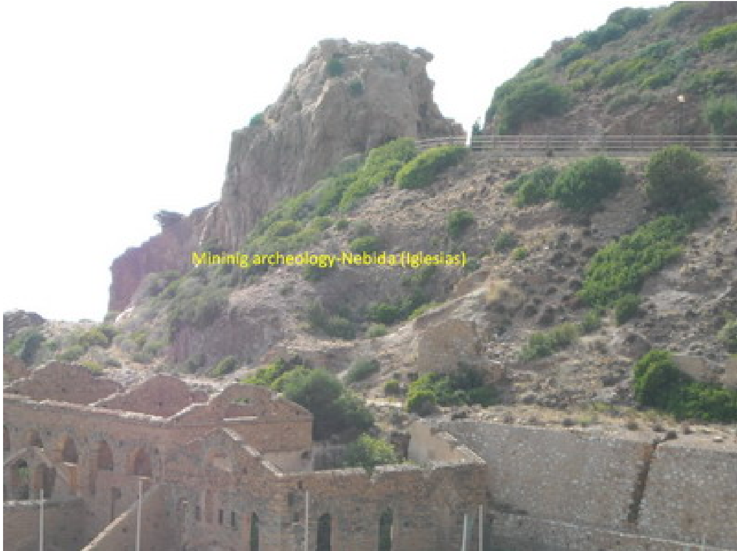
Mininig archeology-Nebida (Iglesias)